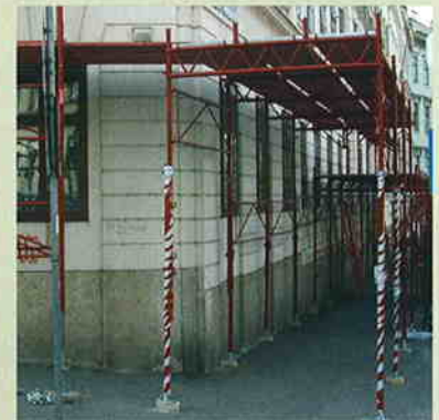
walk-through passage width: 1,50 or 2,00m