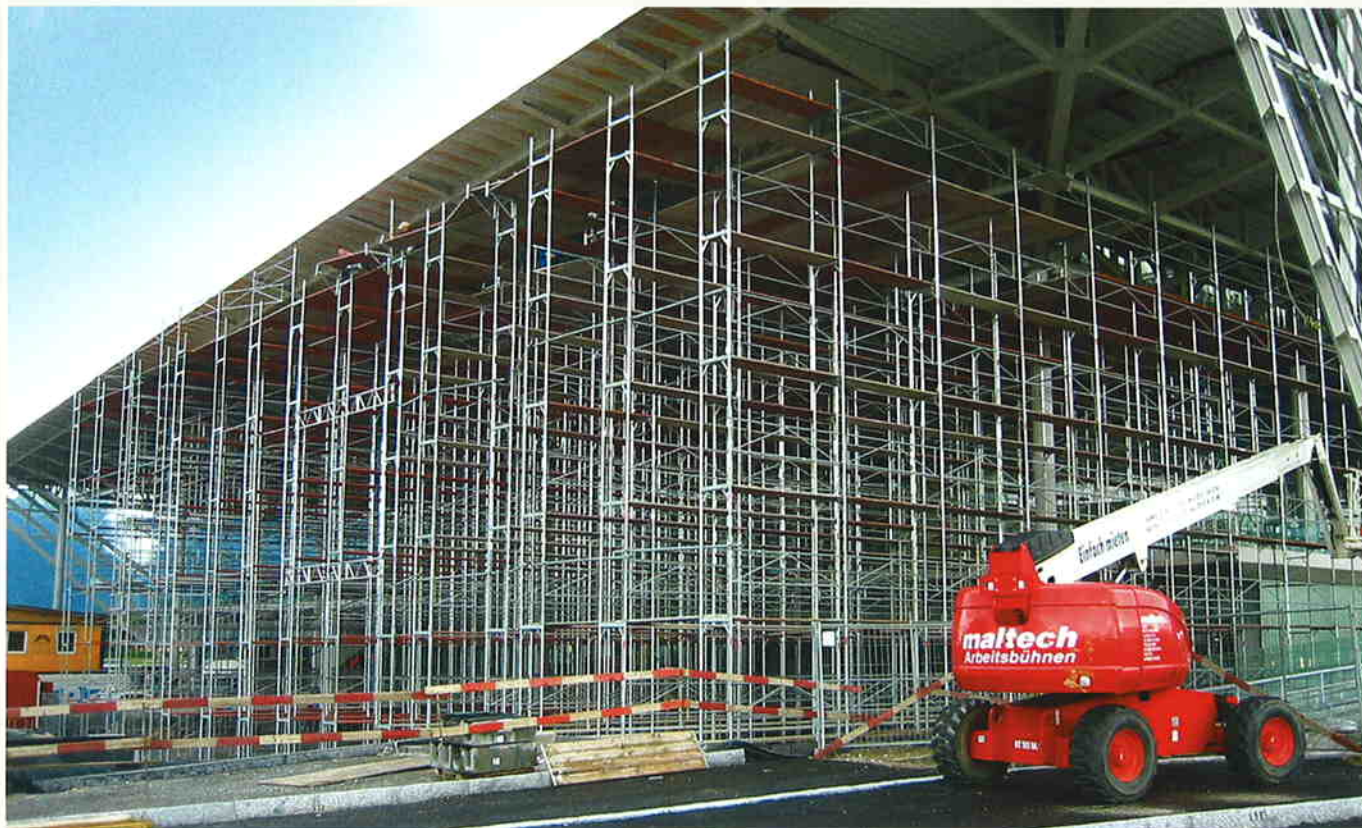
Mercedes Pappas, Salzburg