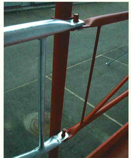
Alu and steel scaffolding can be mixed together