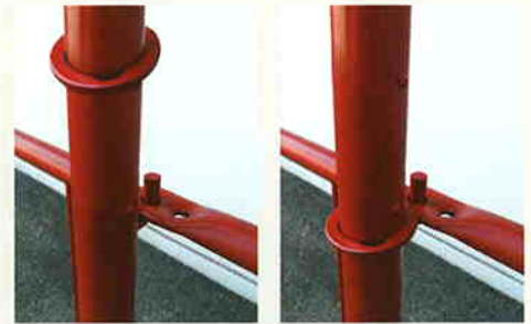
RINGER quick lock system (patented)