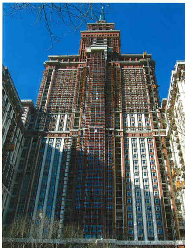
Doppelgelder, 130m high, Moscow