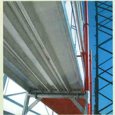
2,50 x 0,60m bearing load: 450kg/m 2 3,00 x 0,60m bearing load: 200kg/m 2