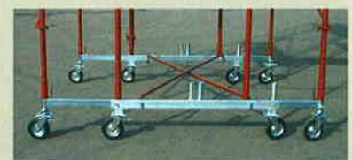
RINGER basic beam with carriage for all scaffoldings with 0,65m frame-width