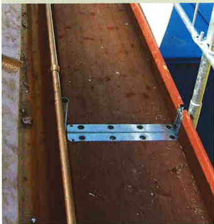
RINGER wooden platform 2,50 x 0,60m