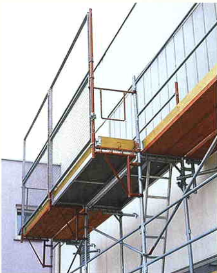
Roof protection with enlarging bracket